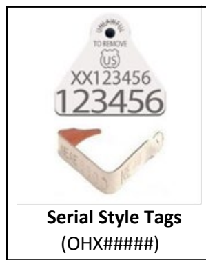
Serial Style Tags (OHX#####)