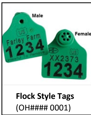
Flock Style Tags (OH##### 0001)